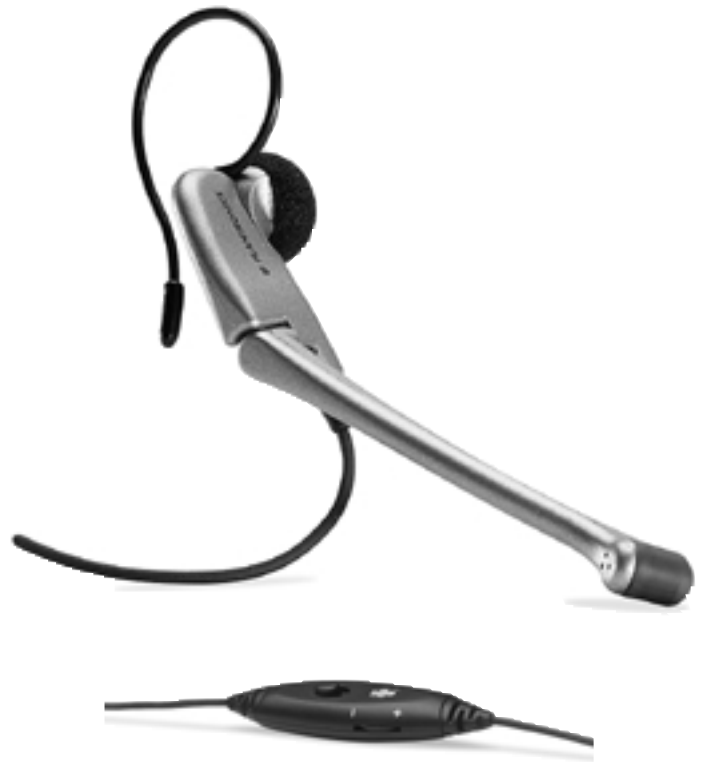
Easy volume and mute control (available on M145)