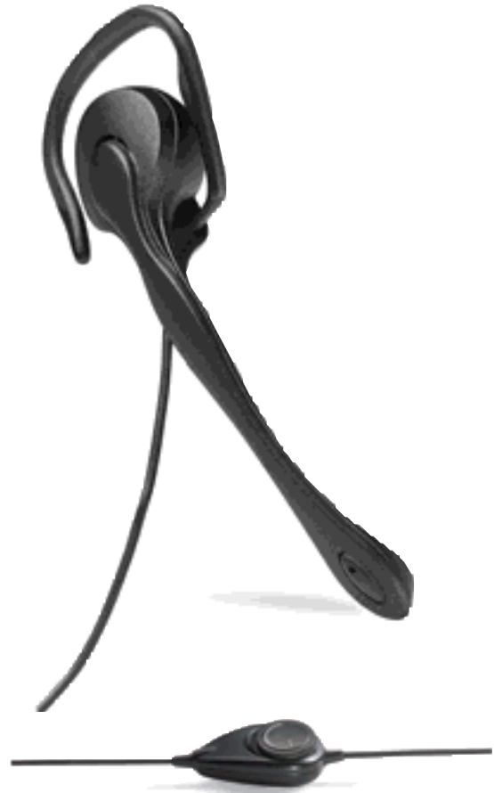
Convenient volume control (available on M124)