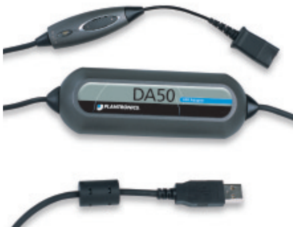
DA50 – USB-to-Headset Adapter